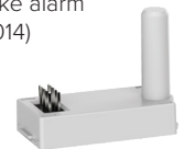
OPTIONAL RF Module Model: EP-HYB-RF-MOD